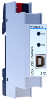
Photo of the device

Compact USB Interface between PC and KNX bus